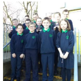
January Pupil of the Month