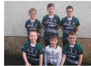
Hurling: SW Antrim Indoor Hurling Champions