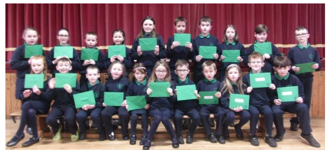
Y6 Cross-Community Programme with Harryville PS