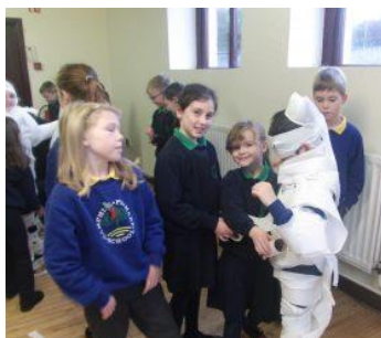
Egyptian Team Building

The aim of the shared education programme is to help the children, from both schools, to understand each other better through work and play. This is an important part of our Personal Development and Mutual Understanding (PDMU) programme.